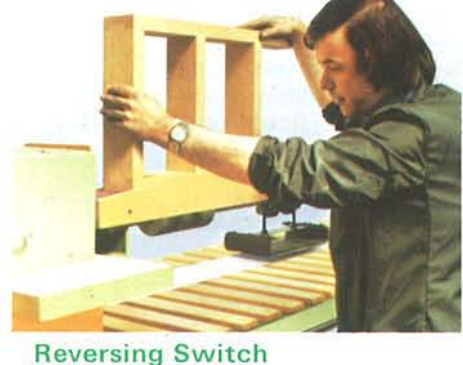
Fitted as standard. Enables sanding of drawers and other built-up components maintaining good dust extraction.

the Same as a Skilled Operator's Salary over 4 Months